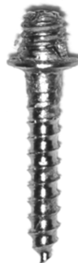
Figure 1 Screw-shaped titanium orthodontic miniscrews with a length of 8 mm and a diameter of 1.4 mm (Dual Tops; Jeil Medical Corporation).

A total of fifteen, 8-month-old New Zealand white adult male rabbits weighing 3000–3500 g were used for the study.