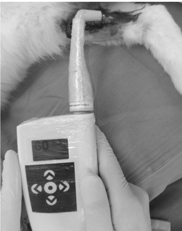
Figure 3 Orthodontic miniscrew stability was monitored using resonance frequency analysis (Ostell; Integration Diagnostics AB) device.

corresponding implants were inserted by prefabricated distance holders in a standard distance of 15 mm.