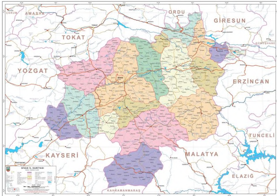
Figure 1: Map of Sivas

References: https://www.harita.gov.tr/urun/sivas-mulk-idare-il-haritasi/333